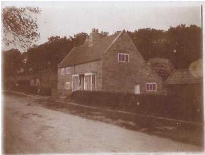
Figure 5: Brandsby Co-operative Shop

shop building still exists and is currently a hairdressers. In 1907 Hugh built a pretty stone-built shop with an attached cottage for the Co-operative manager in the village and moved the dairy down into the village into a purpose-built dairy. These buildings were leased to BATA.