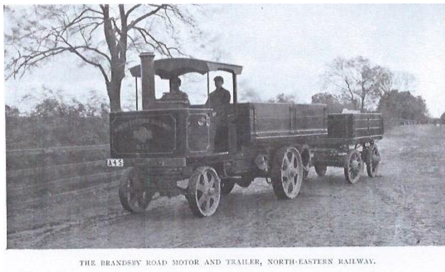
Figure 4: Brandsby steam locomotive (E.A.Pratt, The Transition in Agriculture , 1906 ).

included a chapter called “Brandsby shows the Way”, in his 1906 book. He was particularly impressed by the success of BATA and the transport scheme, tonnage was 89 tons to November of 1904, and increased to 285 tons by November 1905. 41