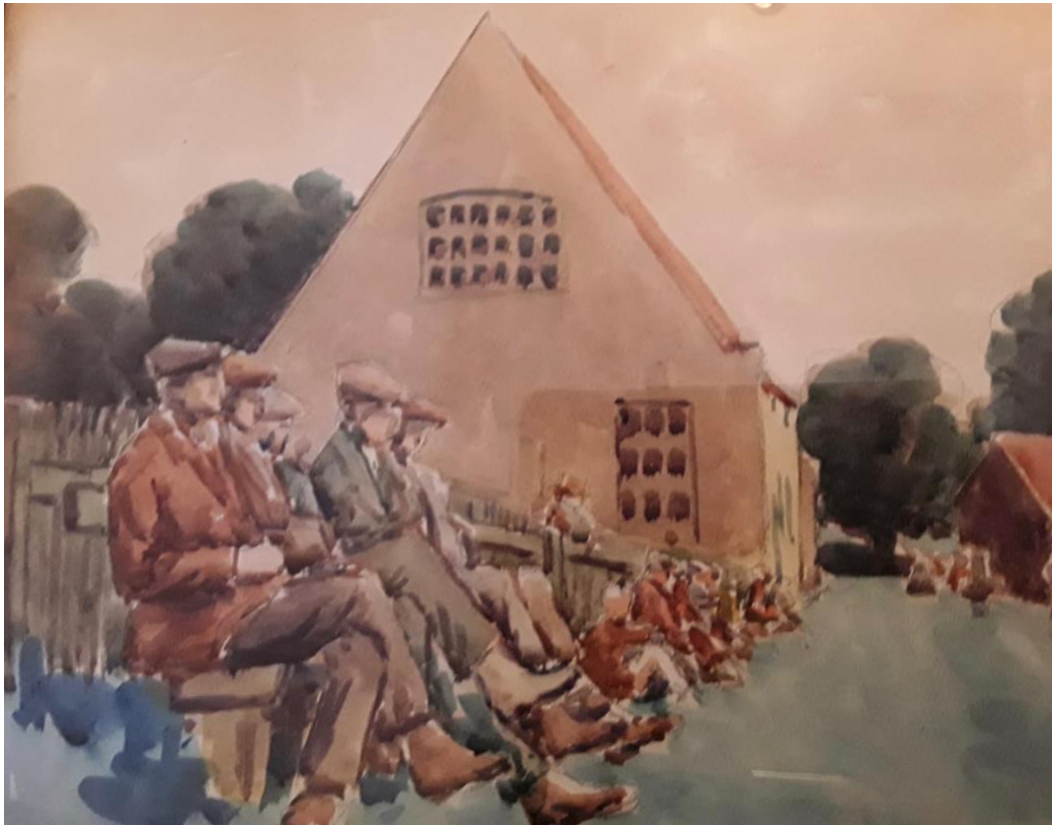
Figure 2: Cricket Week at Brandsby: painting by Fr. Raphael Williams, showing the still existing village hall and the now disappeared pavilion.

part of the village yearly calendar. Family members including, after 1903, Hugh's wife Alice, helped with the cricket teas. A wooden building to serve as a pavilion was built.