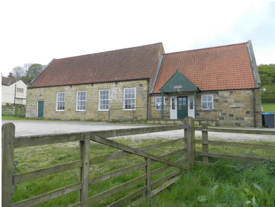
Figure 6: Cholmeley Hall, Brandsby 2018