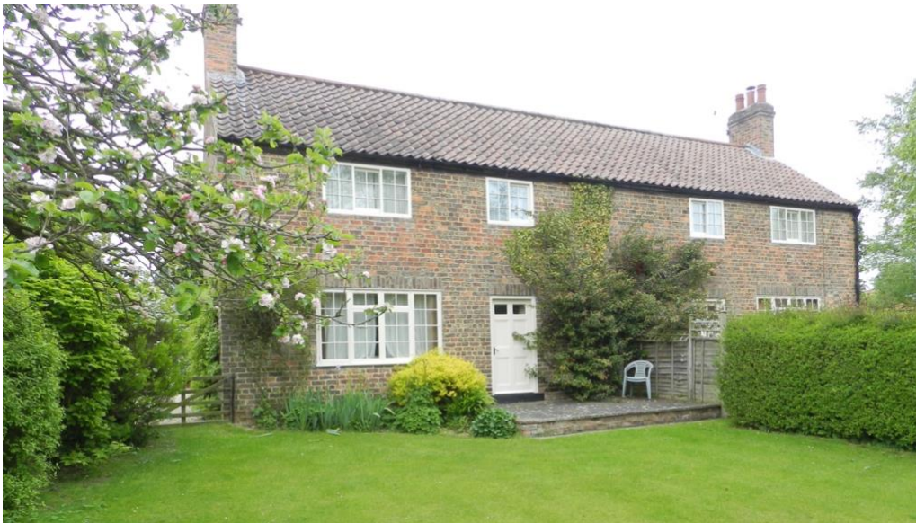
Figure 3: Warren House cottages, built for a total of £347 4s 7d in 1905.

three at Stearsby, pulling down six hovels which had stood on the site. He built one cottage at Low Farm and in 1905 his final pair at Warren House Farm. Besides the living design, Fairfax-Cholmeley attended closely to the external appearance, following the Arts & Crafts principle of beauty and utility at all times, as can be seen in the pleasing lines of the windows and gables and the quality of materials used. This last pair cost a little over budget at £347 4s 7d for the pair.